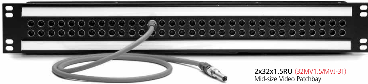
2x32x1.5RU (32MV1.5/MVJ-3T) Mid-size Video Patchbay